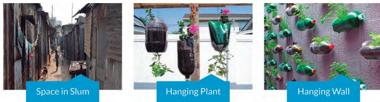
FIGURE 1. HANGING WALL VEGETABLE GARDENS WITH DISPOSED PLASTIC BOTTLES NUTRITION TO PROVIDE ESSENTIAL DIETARY NUTRITION WITHIN HIGHLY CONGESTED SLUM SETTLEMENTS. BANGLADESH